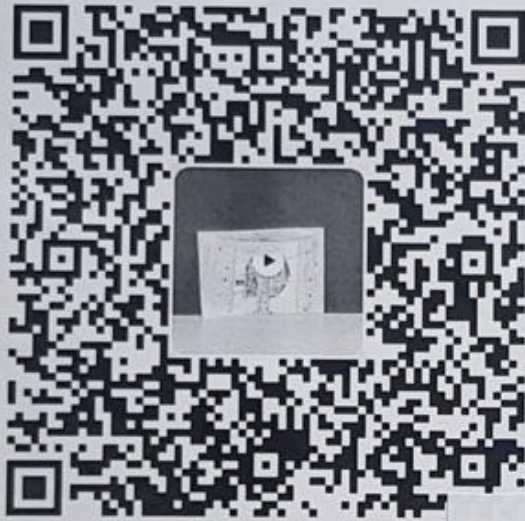
Group C - Final draft

LO: Prepare texts to be read aloud, showing understanding through intonation, tone and volume so that the meaning is clear to an audience.